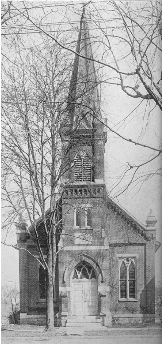
The former St. Mark's Lutheran Church (constructed in 1865), now the Wapakoneta Community Worship Center, was a stop on the historical society's 2008 tour.

The Historical Society will organize the “ Sacred Art and Architecture ” tour of Southwest Auglaize County on Sunday, April 19, from Noon to 4 p.m. Participating churches include: