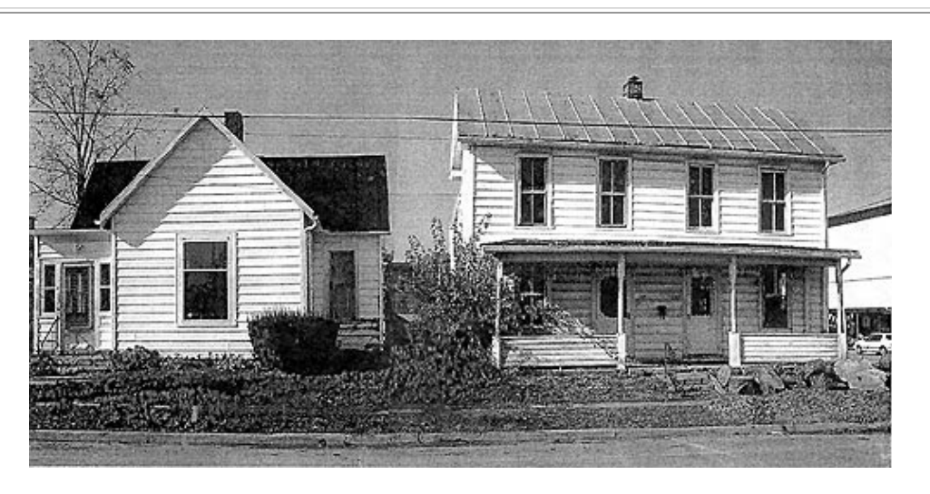
Photo of homes located on North Chestnut Street in St. Marys on October 11, 2003. The three bedroom at 119 Chestnut Street and 125-127 a duplex were razed for the new Telephone Service Company office.